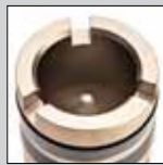
Model F Plunger

For long service life, RoNal float valves are easily rebuilt using our convenient repair kits. Each rubber kit includes parts to rebuild two valves; each metal kit includes parts to rebuild one valve.