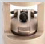
Model G Flapper

Model F, FGAC, and FGA Rubber Repair Kits Include: 4-Side Seals, 2-Piston Seals, 2-Springs Model F, FGAC, and FGA Metal Repair Kits Include: 1-Piston, 1-Valve guide, 1-Piston Seal Retainer