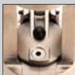
Model GA Ported Flapper